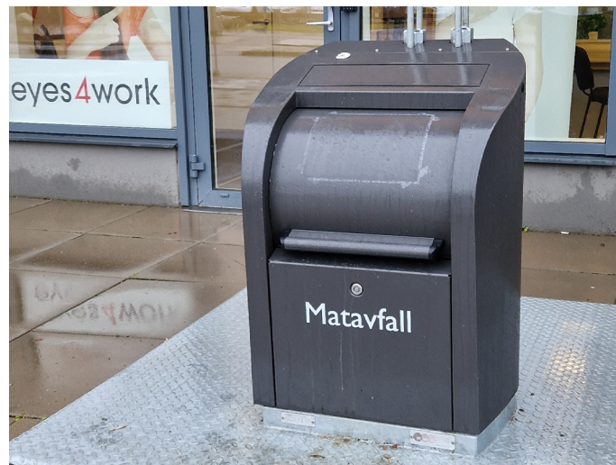
Food waste container

Food waste is all food left-overs (e.g. peels from fruit and vegetables, egg shells and bread etc.). Use the compostable paper bag when throwing your food waste. Remember to excess water from wet waste before you throw it away. Never put plastic or other recyclable garbage with your food waste or in the food waste disposal.