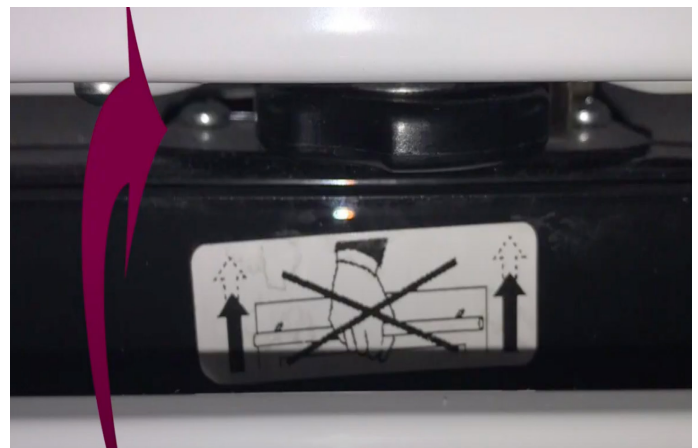
How to open the oven