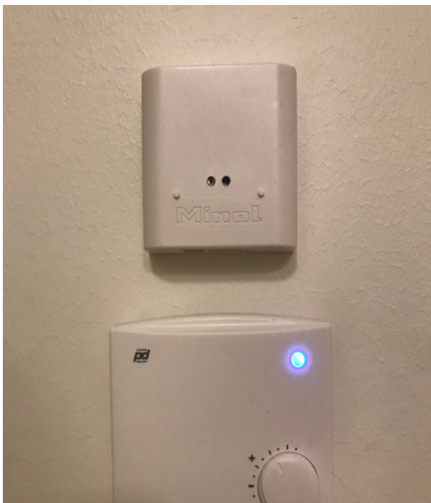
Picture of the thermostat in the apartments

Red light – it is colder in the apartment than the thermostat is set to maintain, more warm air is being supplied.