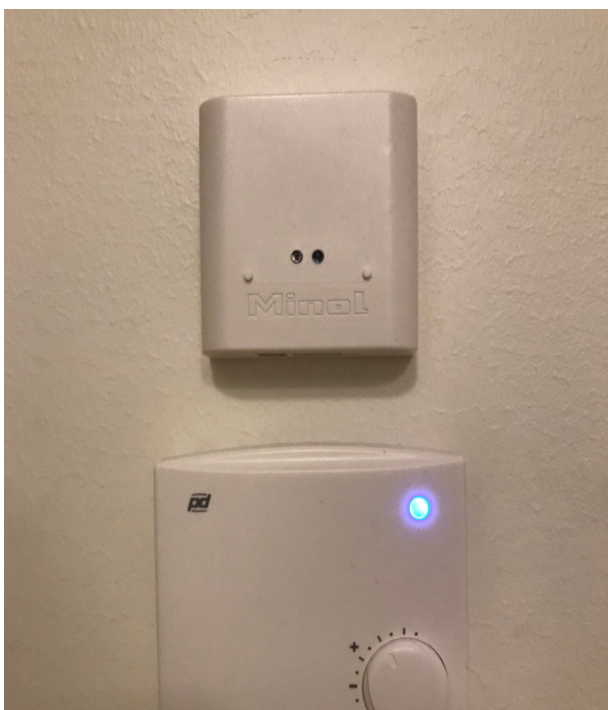
Picture of the thermostat in the apartments

Red light – it is colder in the apartment than the thermostat is set to maintain, more warm air is being supplied.