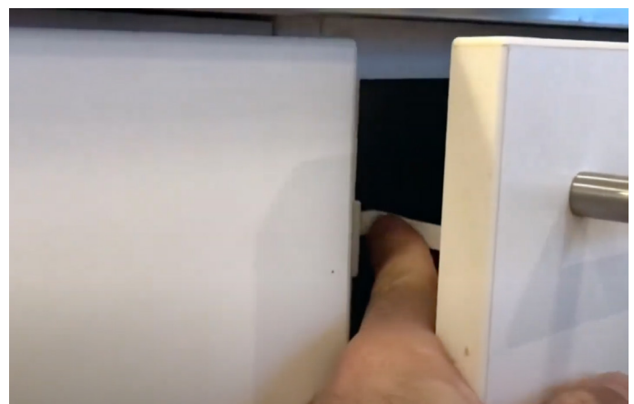
How to open the child safety lock on a cabinet