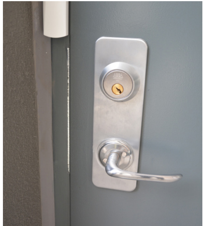
Lock left in service position

If you keep the apartment clean during your stay, the final departure cleaning will become so much easier for you!