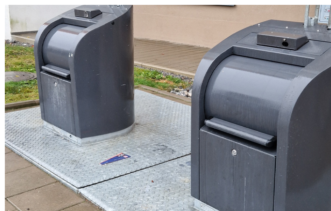
Waste disposal for domestic garbage