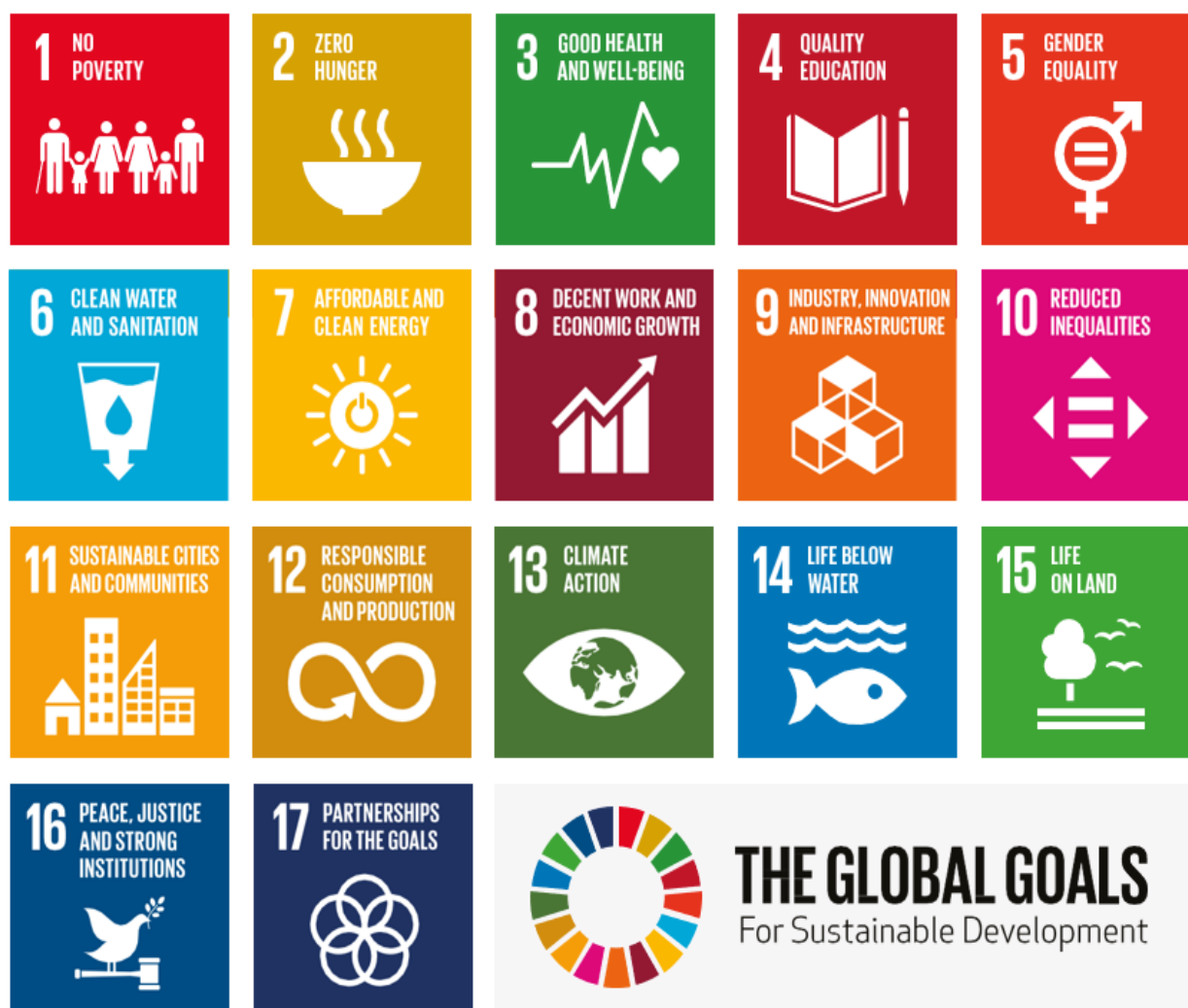
Figure 1: The 17 UN Sustainable Development Goals

The SDGs are a collection of 17 interrelated global goals agreed upon by the UN ( Figure 1 ). The SDGs have spurred change in the policy landscape within the EU and several impressive policy ambitions have been brought forward as the EU holistic approach to sustainable development , including the EU Green Deal 4 , the Circular Economy Action Plan 6 (and the Sustainable Products Initiative 7 ), and the Chemical Strategy for Sustainability 5 , all involving the central goal of achieving a non-toxic environment .