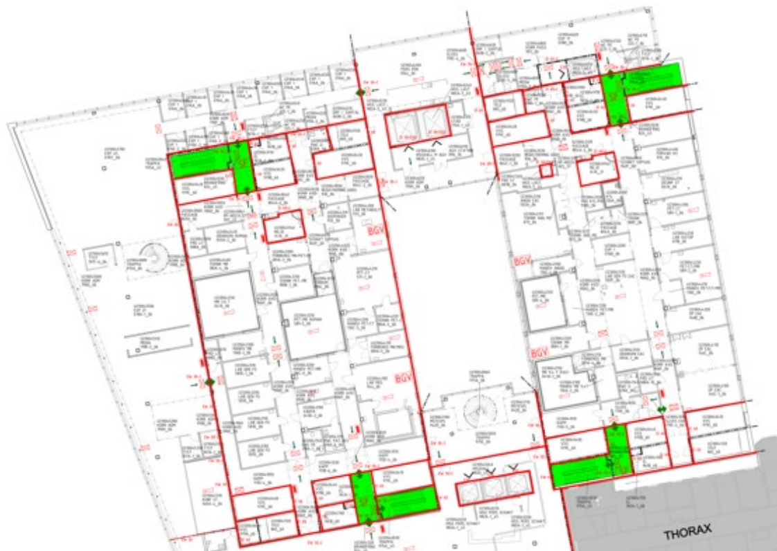
Example showing fire cell boundaries in BioClinicum.

The floors in each building are divided into fire cells where each lab core is a separate fire cell, which will be able to contain the fire if the doors are closed. All evacuation stairwells, refuse/recycling rooms and technical rooms are separate fire cells as well.