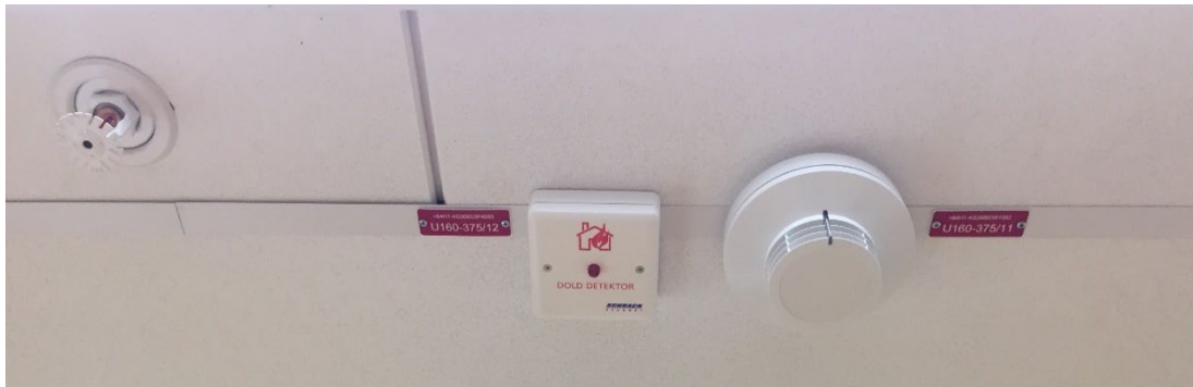
At the left, a sprinkler head; in the center, an indicator panel for a concealed smoke detector located above the false ceiling; and to the right, a regular smoke detector.

Meeting rooms on floors 3–5 have been equipped with speaking evacuation alarms supplemented with flashing lights, and the other areas are equipped with acoustic and optical alarm signals.