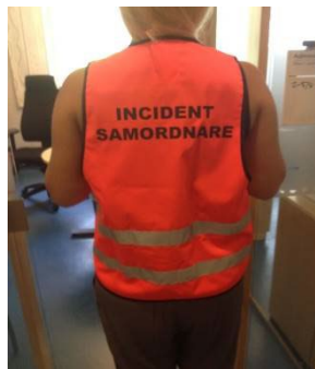
Incident Coordinator vest